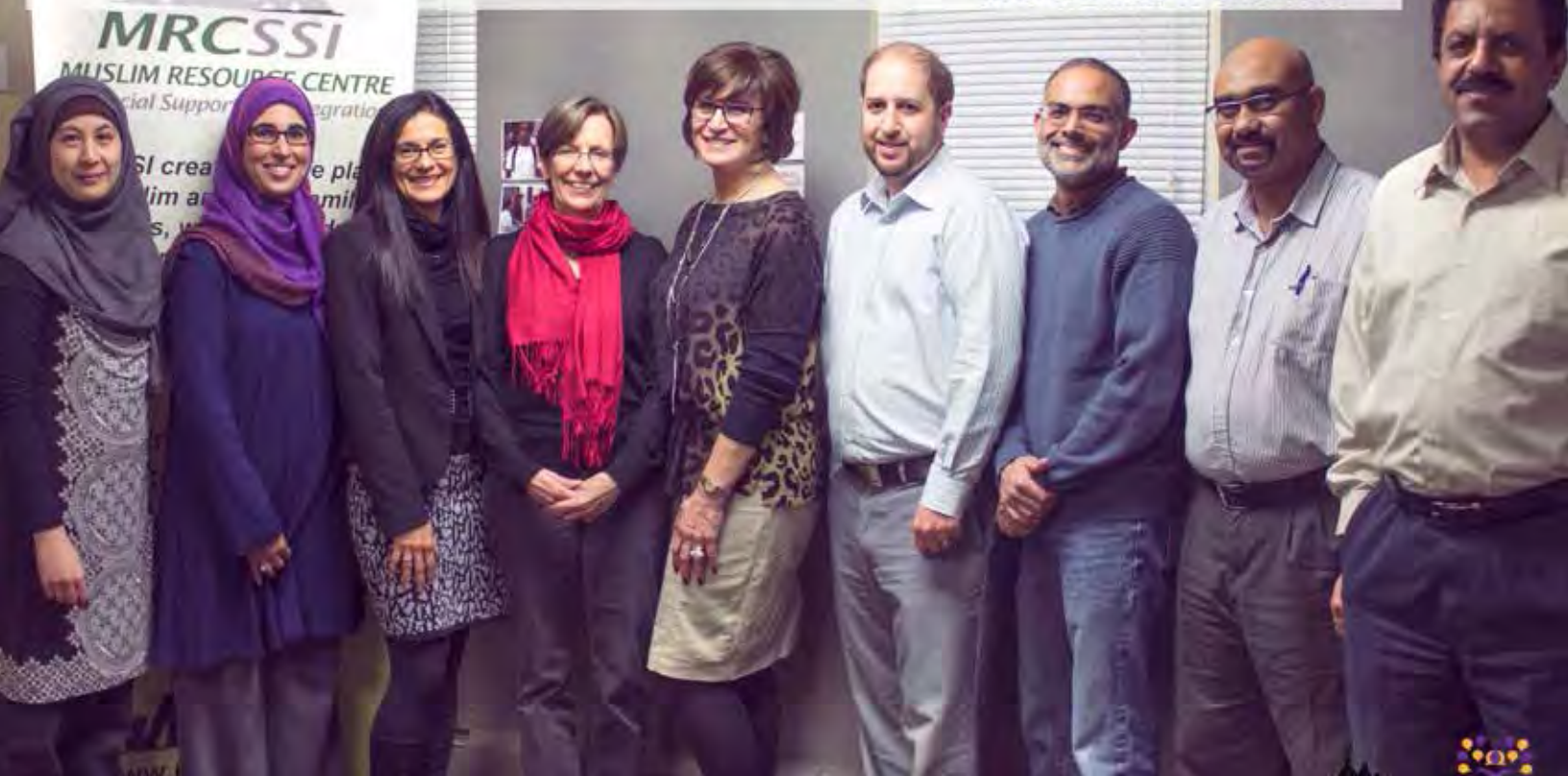
MRCSSI BOARD OF DIRECTORS

PROMOTE HONOUR PREVENT VIOLENCE CAMPAIGN